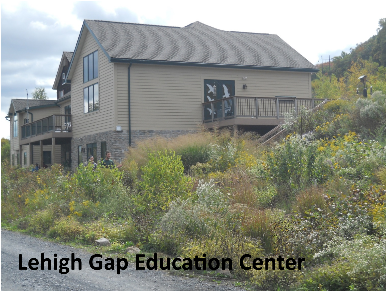
Lehigh Gap Education Center